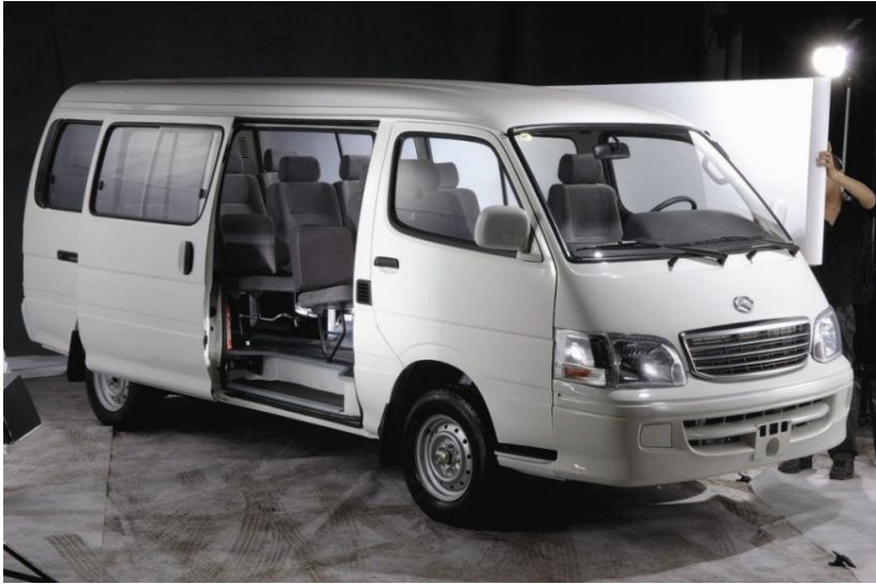
XMQ 6520 15 seats